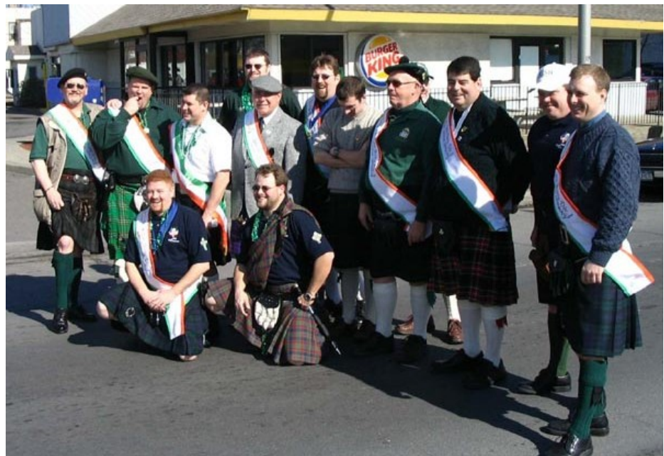
The Kilted Krew on Parade Day

After the Flag Raising we made the trek to Albany to participate in the annual St. Patrick's Day parade while joining our brothers from Watervliet who hosted us for a lunch before the parade. Many thanks go out to their hospitality as they have been kind to us over the years. As always, the Saratoga group made a splash with their presence and had more than one bonnie lass looking for more. Great times were had by all involved.