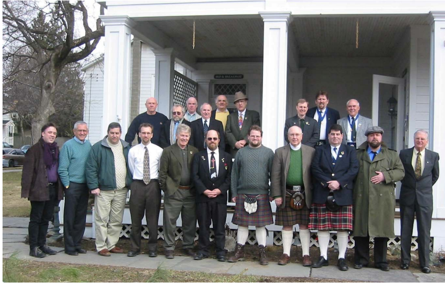
Hibernian Brotherhood at the Communion Breakfast